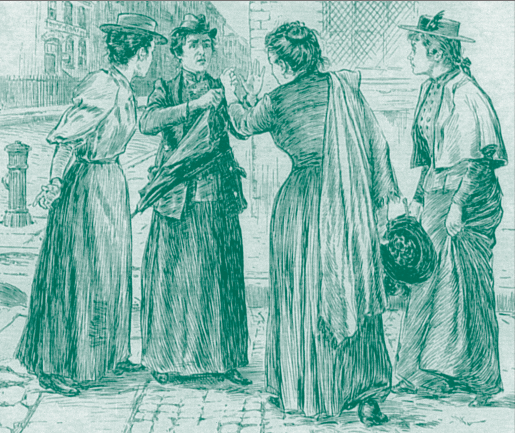
Image of female strikers courtesy of The New York Public Library Picture Collection. NYLHA's annual meeting, this coming September 22, will feature a panel discussion on the uprising of 20,000 shirt-waist workers in 1909, 100 years ago!

Irish and Labor American Labor Museum/Botto House National Landmark 83 Norwood St., Haledon, NJ 07508 May 1 through August 29 Wed. – Sat. 1 - 4 p.m. or by appointment. Photos & documents of the many contributions of the Irish & Irish Americans during historic struggles for workers' rights in the U.S. $5/members free. 973.595.7953; labormuseum@aol.com ; www.labormuseum.org