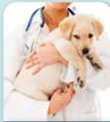
Save on Eligible Vet Bills