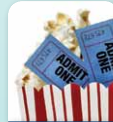
Movie Tickets & Live Events