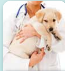
Save on Eligible Vet Bills