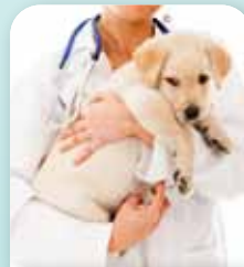
Save on Eligible Vet Bills