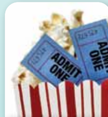
Movie Tickets & Live Events