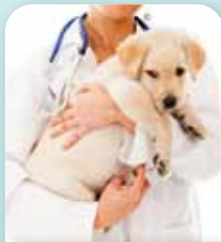
Save on Eligible Vet Bills